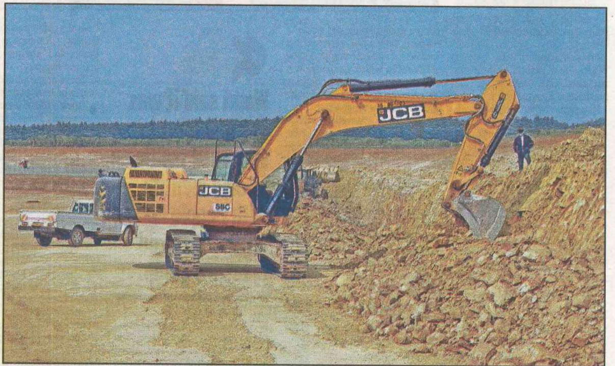
An excavator at the construction site

We had to halt works and find out how to handle the big number of workers we have, with reduced risk of exposure to the coronavirus