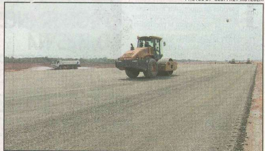
The runway underconstruction at in Hoima district