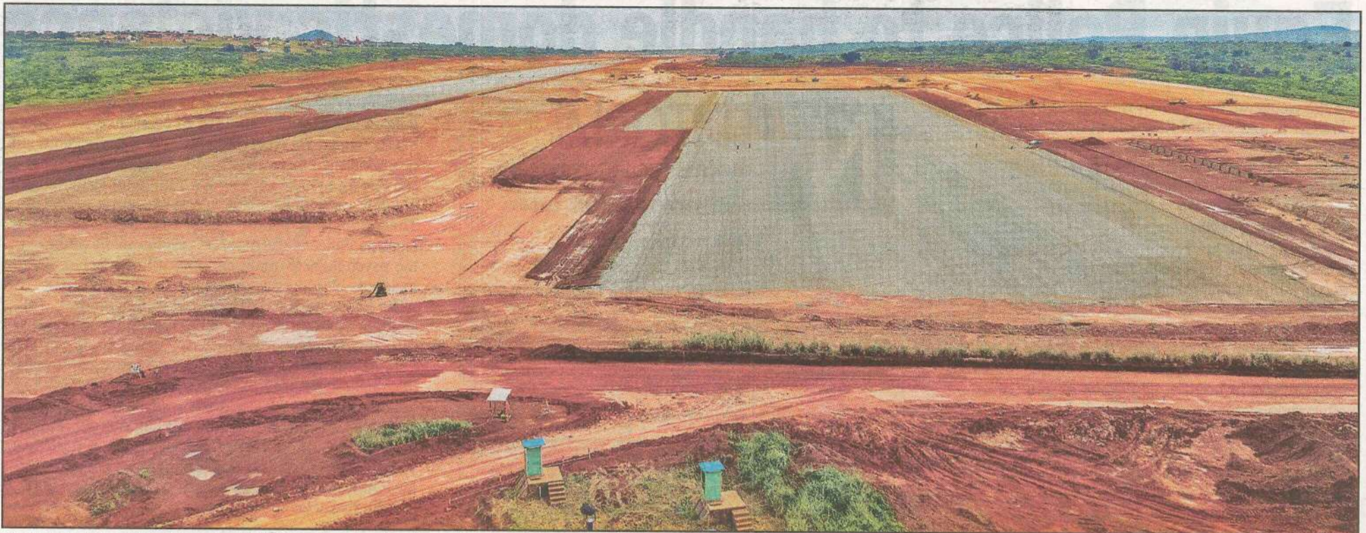
An aerial view of the runway, which is under construction at Hoima International Airport in Hoima district. Construction works are expected to be completed by February 2023